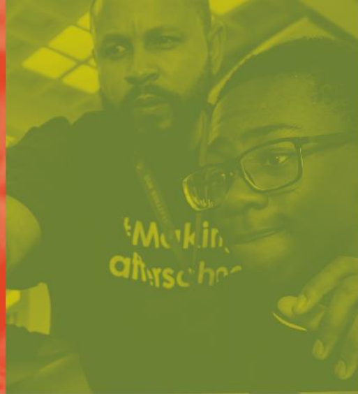
CASE FOR KIDS